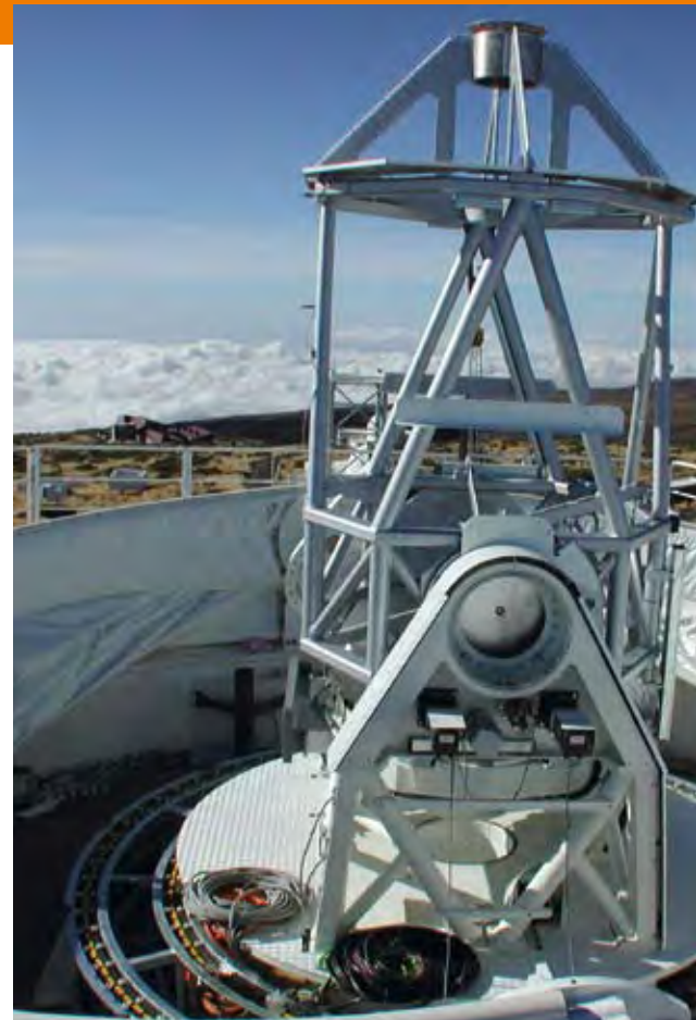
High-tech systems, such as this telescope on Tenerife, also demand sophisticated special solutions for their cabling system.