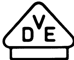
VERBAND DEUTSCHER ELEKTROTECHNIKER