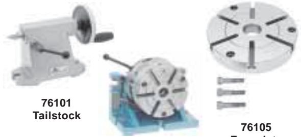
Super Spacer with mounted faceplate