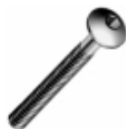
Matching RAMPA Screws type KT

Please complete in order 1) 7 for steel brown coloured 2) 3 for steel nickel plated 3) 1 for steel zinc plated