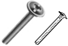
RAMPA Knob Screws type TXM