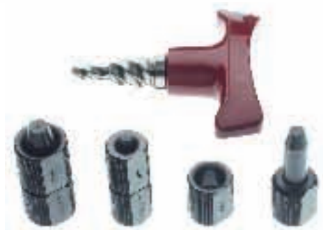
Installation tools for automatic pre-assembly and calibration tools.

No additional sealing gasket required. The seal is metal-to-metal via the sealing edge in the clamping ring.